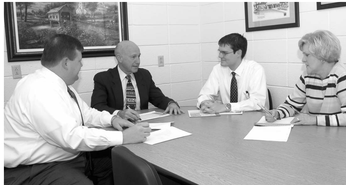
The Institutional Advancement office staff discusses the upcoming "Just Imagine" campaign at a staff meeting.

A long-time friend of the college, BCF's new vice president for institutional advancement chats with the editor of Echoes about his new found responsibilities as a member of the college's administration and what it's like to now be on the inside at BCF.